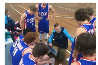
2018 Nationals Tour